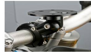
Powervision Mount by Techmount 21600052 59,24